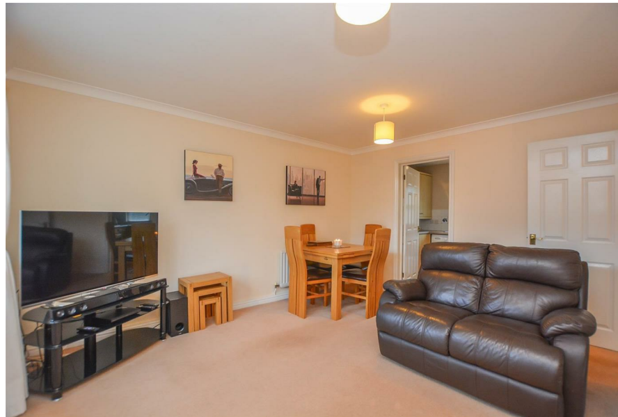
59 Bramble Tye, Laindon, Basildon, SS15 5GR

**Guide Price £225,000 - £235,000** We are delighted to present this well-proportioned two-bedroom first floor apartment, ideally situated on a pleasant residential street in the ever-popular Noak Bridge area. Offered with no onward chain, the property boasts thoughtfully arranged accommodation and the added advantage of two allocated parking spaces.